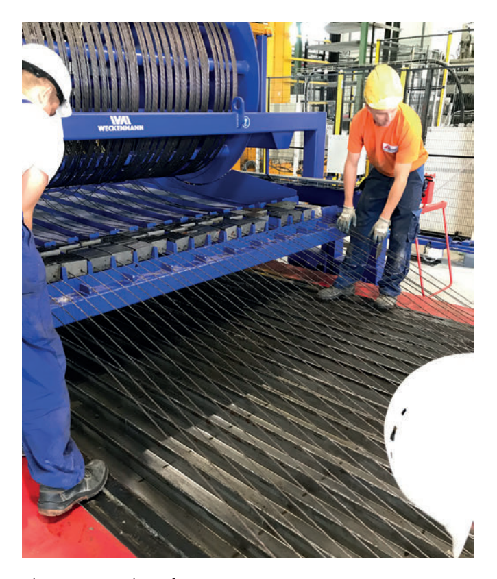
The transport drum for prestressing wires

With the second production plant in Mszczonów near Warsaw, Rector Poland can double its production capacity of prestressed beams and further expand its offer with new products, such as the production of hollow ceiling beams or prestressed lintels.