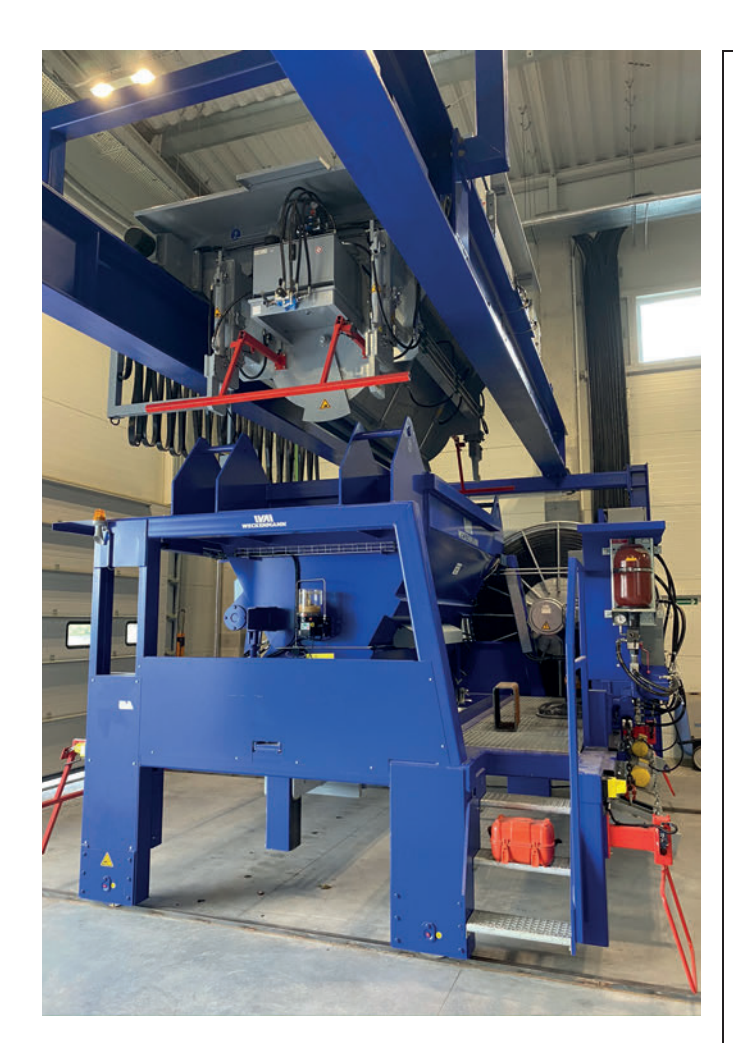
The concrete spreader

Weckenmann Anlagentechnik GmbH & Co. KG Birkenstraße 1, 72358 Dormettingen, Germany T +49 7427 9493-0, F +49 7427 9493-29 info@weckenmann.de, www.weckenmann.com